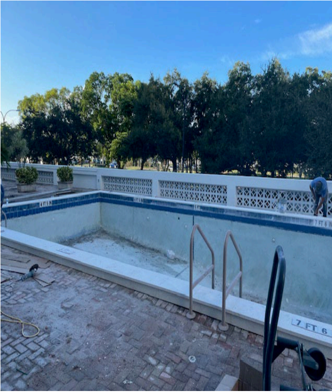
Morning of Day 3